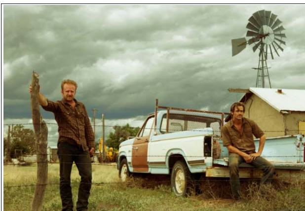
Ben Foster (l) and Chris Pine in HELL OR HIGH WATER