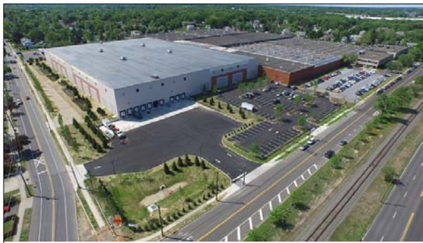
Simon & Schuster's newly expanded distribution center in Delran, NJ.

ness. It has already signed up a number of new clients, including Hazelden Publishing , the premier publisher in the field of addiction and recovery, with whom S&S signed an agreement, effective January 1, 2017, to handle trade sales and distribution of Hazelden's print and digital books in North America.